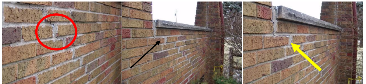
Three Photos across with a circle, black and red arrows.